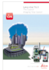
Leica Viva TS15 Product brochure