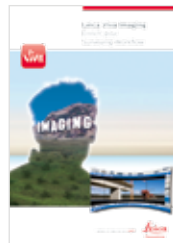
Leica Viva Imaging Product brochure