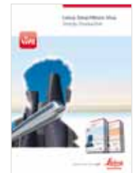
Leica Smartwrx Viva Software brochure