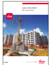
Leica Viva GS15