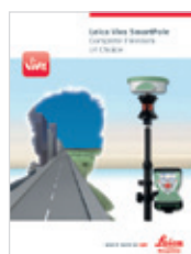
Leica Viva SmartPole Product brochure