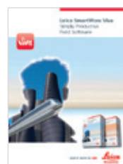
Leica SmartWorx Viva Product brochure