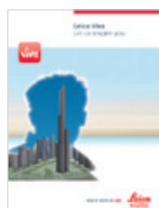
Leica Viva Overview brochure

Illustrations, descriptions and technical data are not binding. All rights reserved. Printed in Switzerland – Copyright Leica Geosystems AG, Heerbrugg, Switzerland, 2010. 774089en – VI.13 – galledia