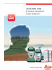
Leica Viva Uno Product brochure