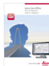
Leica Viva LGO Product brochure