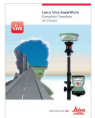
Leica Viva SmartPole Product brochure