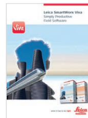
Leica SmartWorx Viva Product brochure