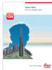
Leica Viva Overview brochure

Illustrations, descriptions and technical data are not binding. All rights reserved. Printed in Switzerland – Copyright Leica Geosystems AG, Heerbrugg, Switzerland, 2012. 774100en – 05.14 – galledia