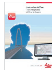
Leica Viva LGO Product brochure