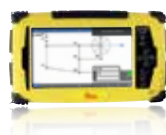
Leica iCON CC66 Rugged, mobile tablet PC with enhanced connectivity and functionality.