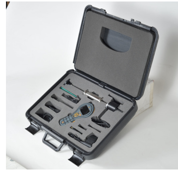
MMS2 Hard Carry Case Kit