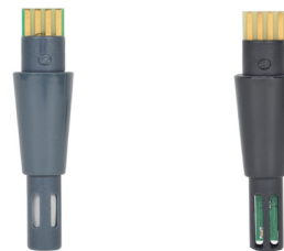
Hygrostick part number POL4750, for high moisture applications.

The MMS Plus may be used with three styles of interchangeable humidity probe, the Hygrostick, the Quikstick and the Quikstick ST. The Hygrostick (grey POL4750) can be used for high moisture applications such as concrete measurement. Quikstick (black POL8750) is a general purpose, fast-responding full range sensor.