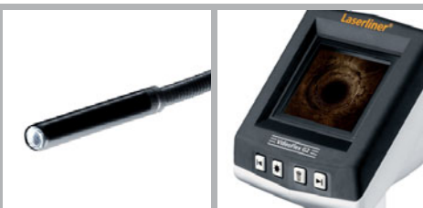
Camera head (ø 9 mm) with LED-Lighting 3,0" LCD